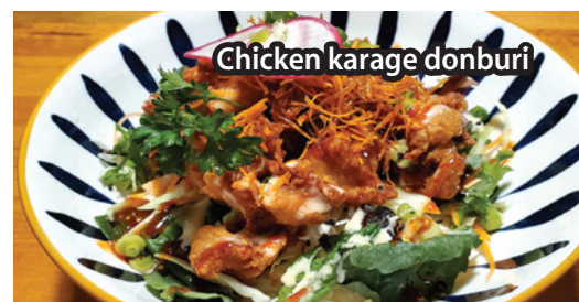
Chicken karage donburi