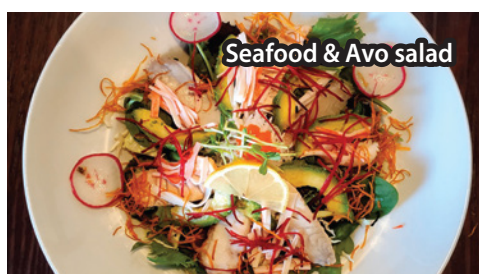
Seafood & Avo salad