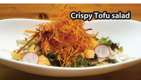
Crispy Tofu salad

Hot Stone Bowl comes with miso soup 17.00 A rice bowl with assorted vegetables and house hot sauce Choose : Beef / Chicken / Tofu / Kimchi Unagi + $3 / Spicy Tuna + $2 / Brown Rice + $2