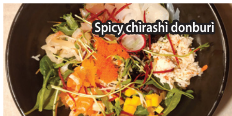
Spicy chirashi donburi